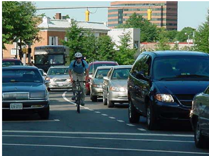
Arlington County currently has 12 miles of bike lanes, with plans for 10 additional miles in 2003.