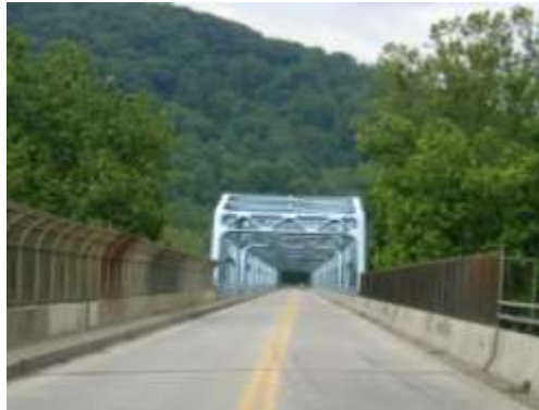
Point of Rocks Bridge