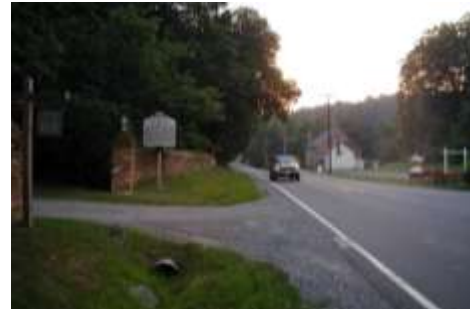
Route 50 in Aldie – high speeds and lack of paved shoulders make bicycling difficult.

While off-road sidepaths are often provided adjacent to newer developments, they are rarely designed well for bicycling; they are narrow (less than 8 feet wide), have poor pavement or surface quality, and include frequent curves and undulations that reduce their efficiency for utilitarian travel. Often they are provided only on one side of the road, and they end at the property line of the development without connections across frontage of undeveloped property or older parcels that were not designed with sidepaths.