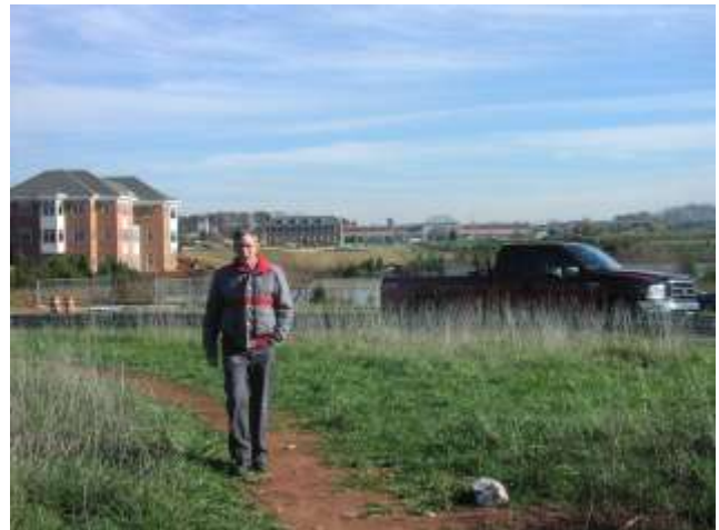
On many roads, sidewalks are provided on one side only, or are discontinuous.

Residential and commercial land development patterns that were common in the past have also created considerable barriers to bicycling and walking. Frequently, the internal roads and neighborhood streets of residential and commercial developments do not link with those of the neighboring development, establishing each new activity node as an isolated pod. Bicycle and pedestrian trips within and between adjacent developments are made much longer and more indirect, and require use of roads with heavy traffic volumes. Moreover, many developments are designed to limit access to only one or two locations, which often provide accommodations for only motor vehicles, thus making bicycle and pedestrian access difficult.