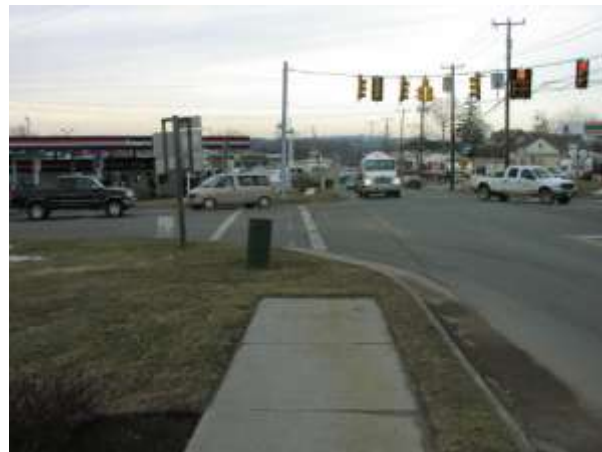
Physical barriers to bicycling and walking are common.

This Bicycle and Pedestrian Mobility Master Plan (Plan) is the product of many hours of work by a Citizens' Advisory Committee and extensive public input, and its adoption as part of the County's Comprehensive Plan provides a framework for a multi-modal County transportation system.