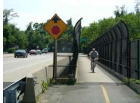
Washington and Old Dominion Trail

While growth of the road network has accompanied Loudoun's dramatic population growth in recent years, expansion of the bicycle and pedestrian network has not. Bicycling or walking is often not a safe or convenient option. This situation has the greatest impact on County residents who are unable to drive or cannot afford to own and operate an automobile.