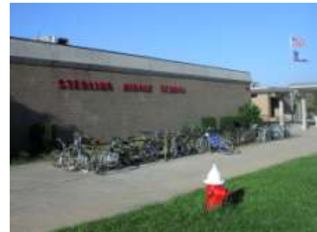
Sterling Middle School

Creating safe routes to school requires action on a number of fronts. For access to be effective, both the school grounds and nearby roads and developments need to provide safe accommodations. New schools and new developments adjacent to schools need to be designed and built using the bicycle - and pedestrian - friendly policies and techniques advocated by this plan. Existing schools and neighborhoods must be retrofitted. In addition to the physical improvements, education of students, especially those of elementary school age, is needed to ensure adequate skill levels and encourage safe walking and biking behavior. Moreover, enforcement and guidance is needed in the form of crossing guards and policing of motorists and all travelers in school zones.