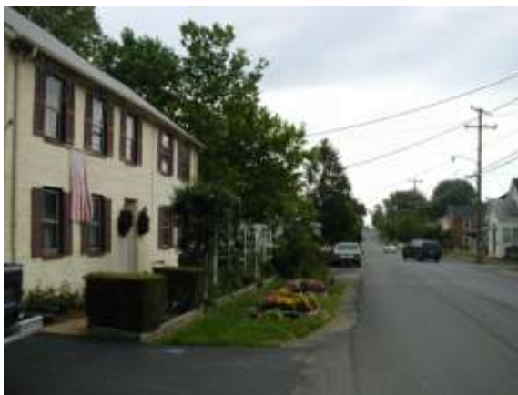
Lovettsville – lack of sidewalks makes walking conditions difficult.

The availability of sidewalks in the region varies widely. As a general rule, the larger older communities such as Leesburg, Purcellville and Sterling, have the best sidewalk systems, and the town centers are generally pedestrian-friendly. However, there are many places where neighborhoods are not connected to nearby destinations with sidewalks, even in locations where the destination is less than a quarter mile away.