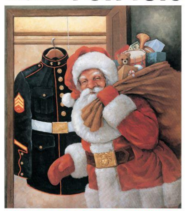
U.S. MARINE CORPS RESERVE

For more information go to www.toysfortots.org