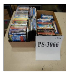
The current Loudoun County government online surplus auction includes bargains on a variety of items, including tire cables, children's toys and children's DVDs and Blu-ray Discs.