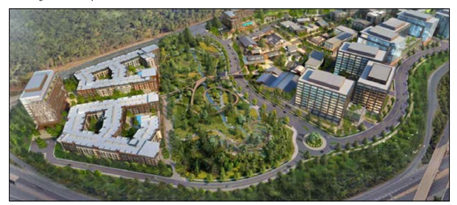
Rivana development at Innovation Station

The COVID-19 pandemic was, according to TIME Magazine, "apocalyptic" for public transit. This apocalypse hit Metro particularly hard–ridership and revenue were down by as much as 80%. The Metro Board took steps to manage this shortfall with reduced service, and ultimately the federal government came through with enough assistance to keep us operating at least through FY23. The Board is evaluating long term fare policies and service levels to meet the needs of the regional recovery.