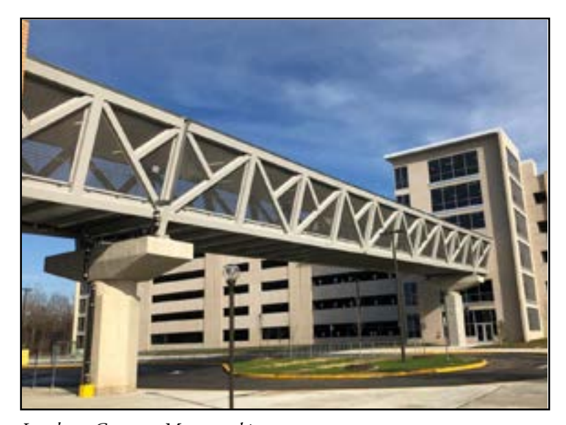
Loudoun Gateway Metro parking garage

s the sole remaining Supervisor that voted to bring Metro to Loudoun and (now) as a Metro Board member, completion of Silver Line Phase II has been of paramount concern to me. However, the timing of the project is not within Metro's control. There has been a series of issues identified by Metro that have arisen during the final stages of construction. The $3.4 billion project is being constructed by the Metropolitan Washington Airports Authority, and MWAA has announced that the major issues should be resolved by Labor Day of this year. If that timeline holds, Metro will be able to undertake testing in the fall and Phase 2 will become operational for public use in early 2022. The Metro Board's FY22 budget will reflect this operating reality, which I hope will represent the final delay in this long-awaited project.