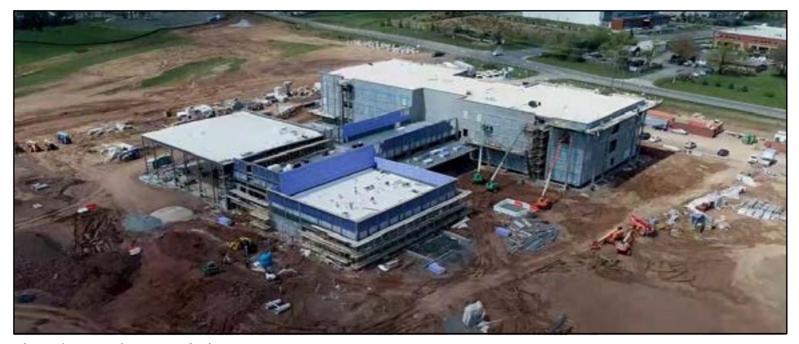
Elaine Thompson Elementary School construction is in progress.

Finally, while it is not a County project, the Catholic Diocese of Arlington built a new campus for the private Paul VI High School east of the Braddock/Gum Spring intersection in South Riding. It opened in the fall of 2020 amid challenges due to COVID-19 and was operational for the past school year.