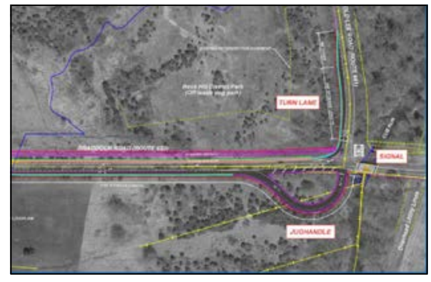
Proposed jughandle lane at intersection of Braddock and Old Lee

Fairfax County has the lead on this project and I'm limited on what I can do now, but more work must be done to move this forward.