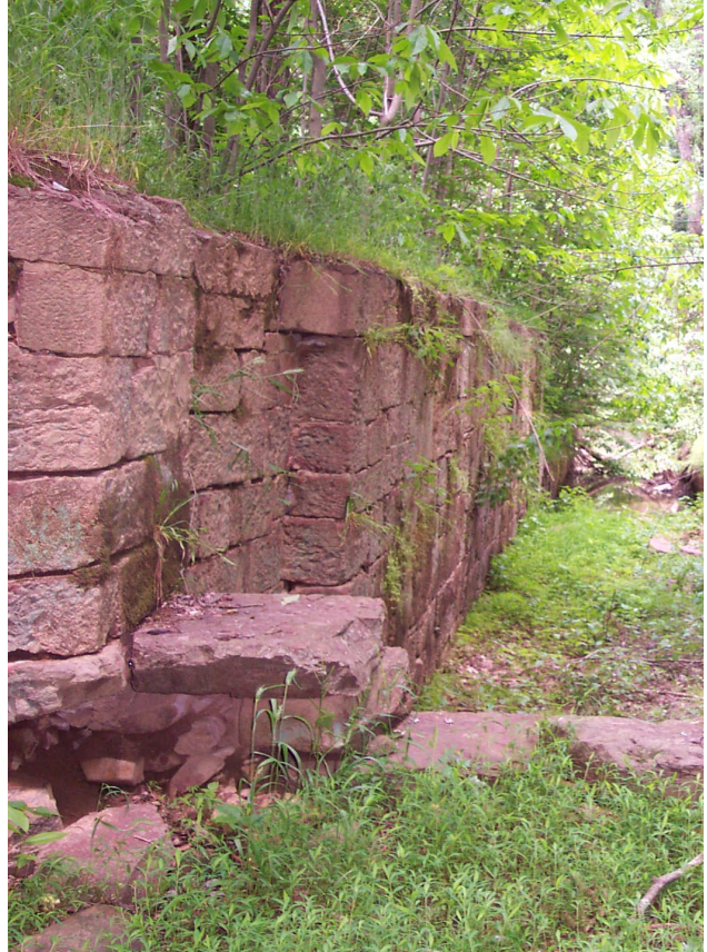
Locks at Riverpoint Drive Trailhead