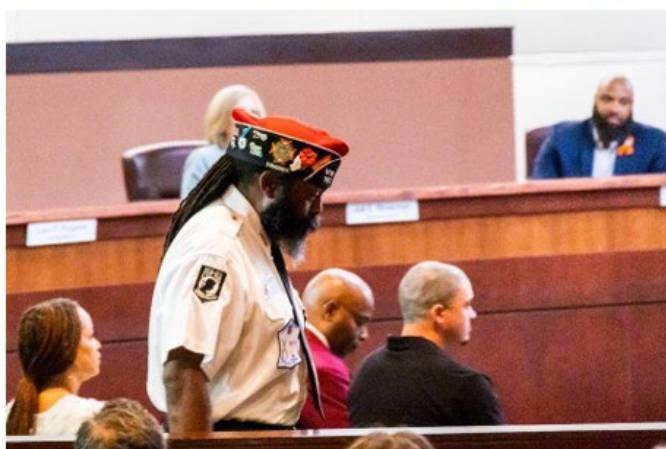
Rural Town Hall