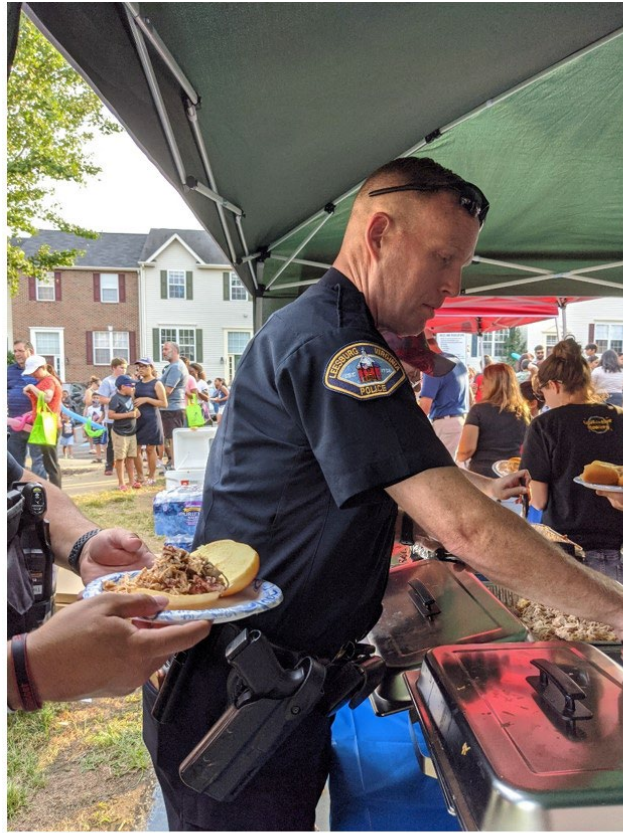
Leesburg Police officers, who embody the best of community-based policing, served dinner to residents of Sycamore Hill at last year's National Night Out.

National Night Out: All Town residents are invited to participate in this annual community building event tonight from 6 to 8 pm in the Leesburg Mobile Home Park community. The Leesburg Police Department will have police vehicles and equipment on display, and children are invited to meet our officers in person. Leesburg Volunteer Fire Company and Town of Leesburg's Streets Division will also have equipment on display. Representatives from the Town of Leesburg's Diversity Commission will be in attendance. Other activities will include refreshments, activities for children, music, and one of our sponsors, Target, will be hosting a bicycle raffle. As the Leesburg Police Department's premier community relations event, National Night Out serves to reinforce crime and drug prevention awareness while generating support and participation for local anti-crime efforts. It helps foster and strengthen neighborhood collaboration and police-community relations. National Night Out is a national community-building campaign that promotes police-community partnerships.