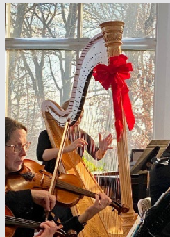
I watched the "Festive Sounds of the Season" concert played by the Loudoun Symphony Orchestra (LSO). As a former LSO Workshop member, I have been extremely impressed by the LSO's progression as an organization. It was great to see community members coming together for the arts and I will continue to advocate for arts investments!