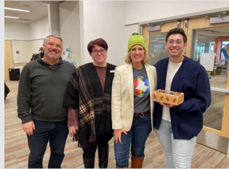
The Equality Loudoun Cookie Exchange where we celebrated the holiday season with friends and allies fighting for LGBTQ+ equality in Loudoun County.