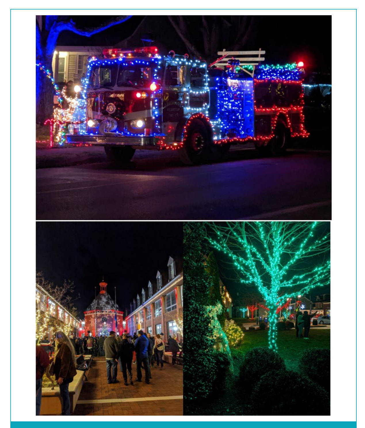
Holidays with the Cops Program