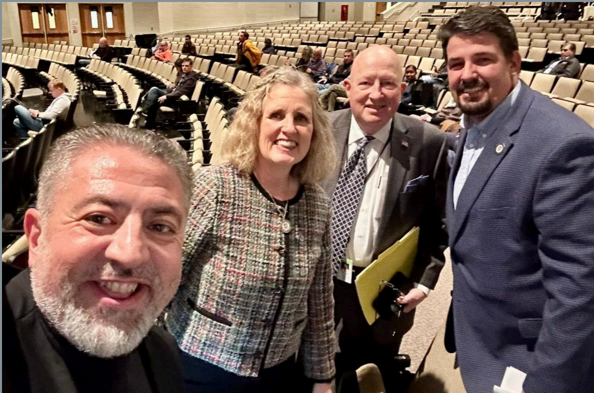
Potomac View Childcare Sign Development Plan Approved