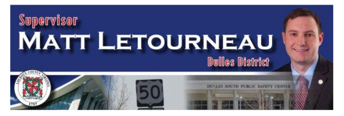
August 8, 2013