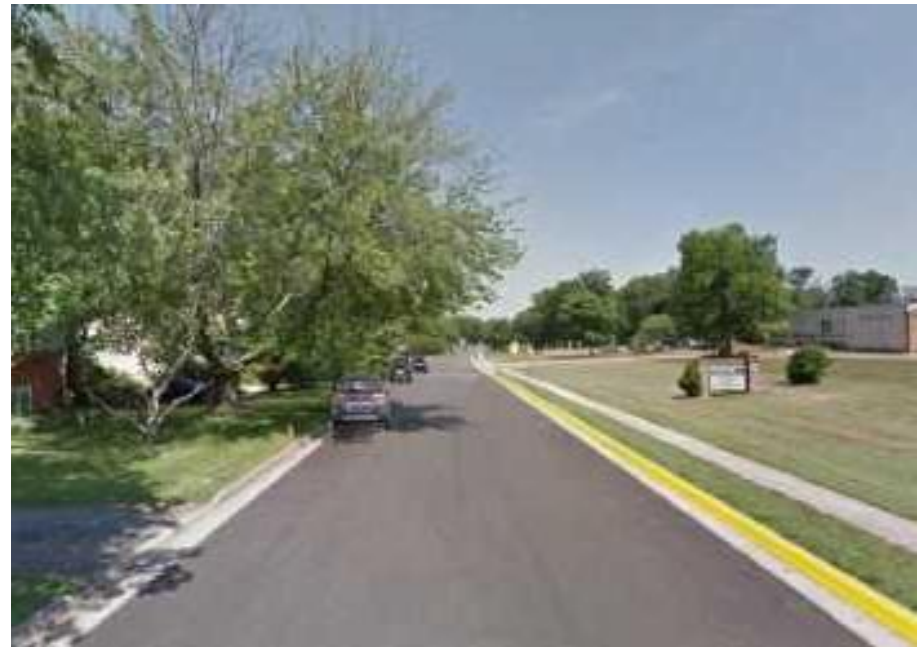
Proposed Rendering West Poplar Road, Sterling VA