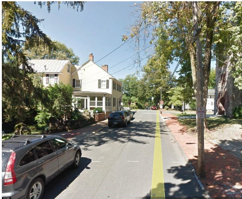
Cornwall Street, Leesburg VA