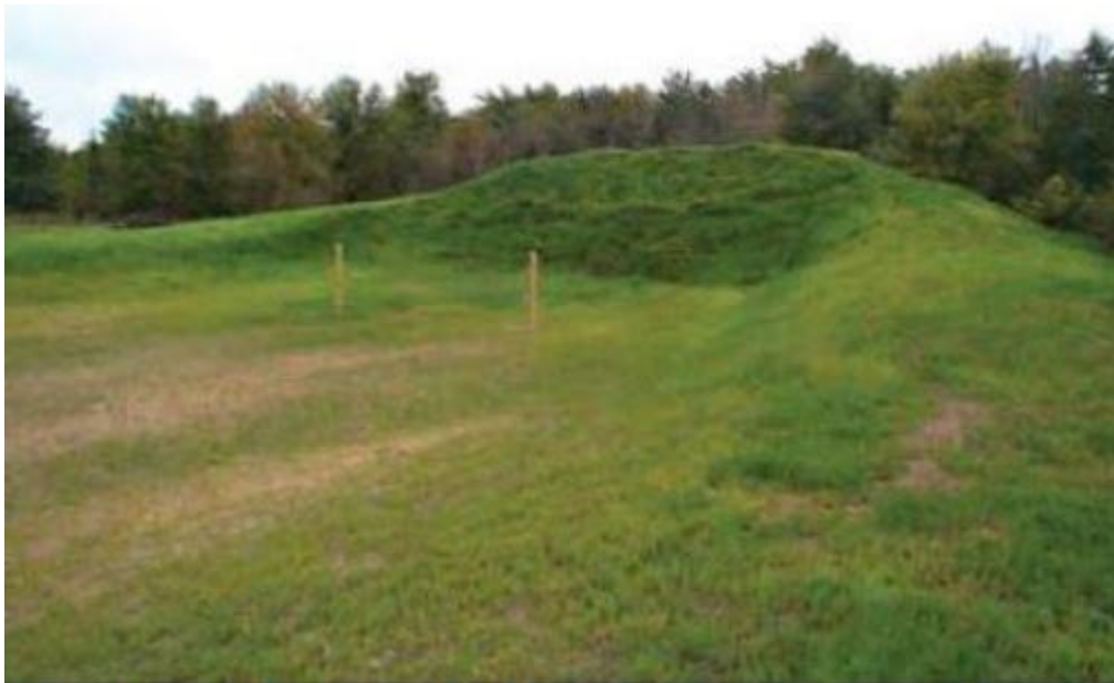
Image from "Outdoor Shooting Ranges: Best Practices" published by Minnesota Department of Natural Resources, 2003.

I believe this motion is a step in the right direction and appreciate Supervisor Meyer's efforts to make areas safer in western Loudoun and the transition policy area. The reckless discharge of firearms is happening way too often in Loudoun County. In fact, a woman was recently wounded by a neighbor's reckless shooting. I am afraid it will only get worse unless the Board takes action to hold the persons who are doing the reckless shooting accountable.