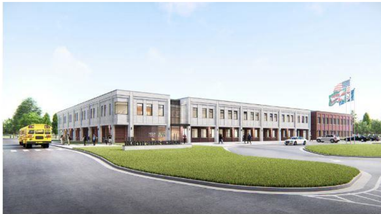
Front Entrance and Bus Drop Off view of North Star School