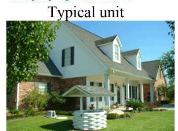
B.E.S.T. 1 Installed

Figure 2—Another example of a possible aerobic unit design Adapted with permission from Pennsylvania State University College of Agriculture Extension Service