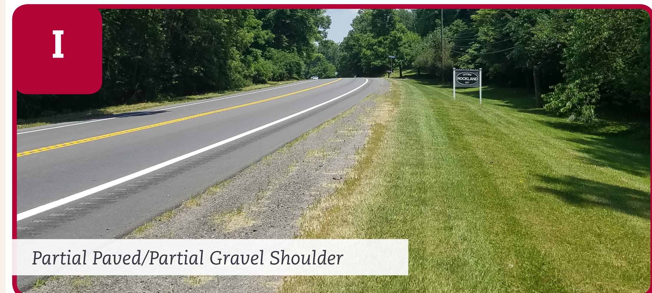
Partial Paved/Partial Gravel Shoulder