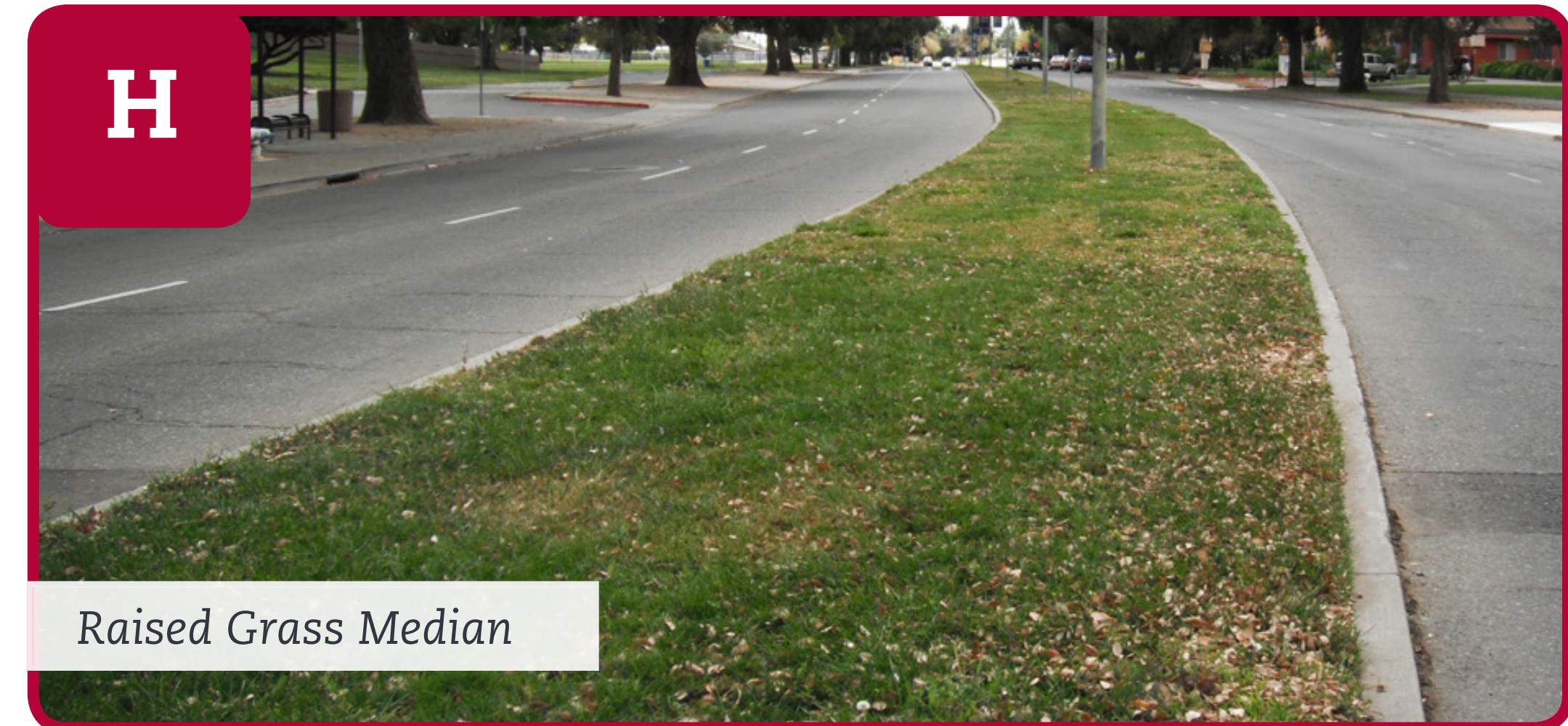
Raised Grass Median