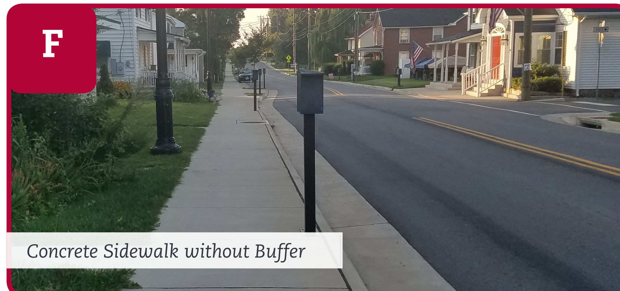
Concrete Sidewalk without Buffer