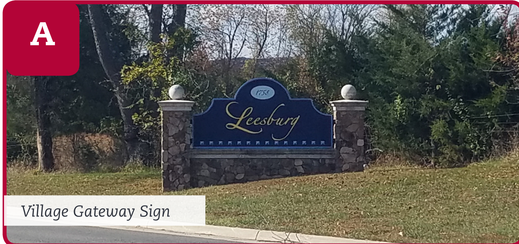
Village Gateway Sign