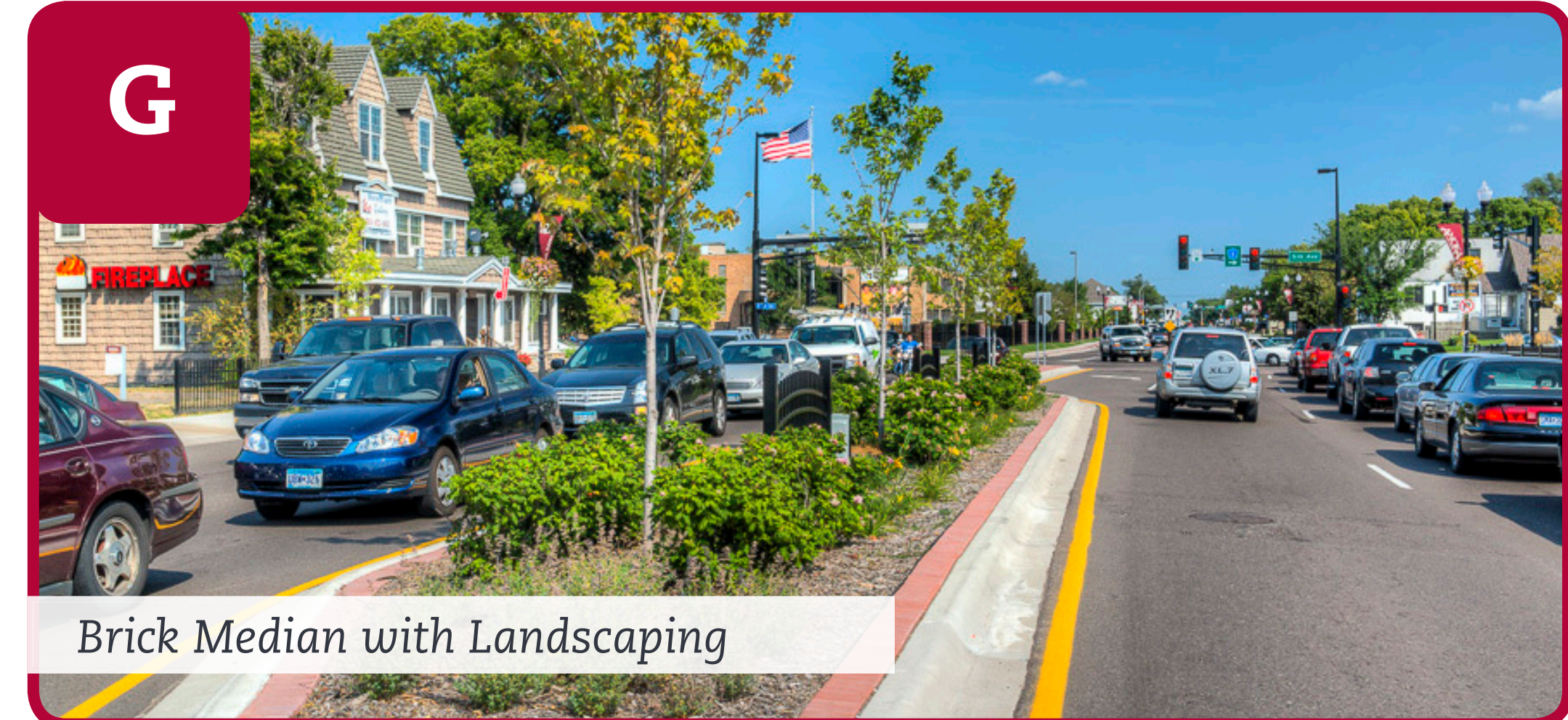
Brick Median with Landscaping