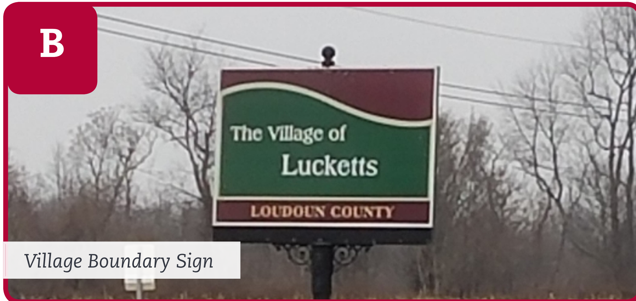
Village Boundary Sign