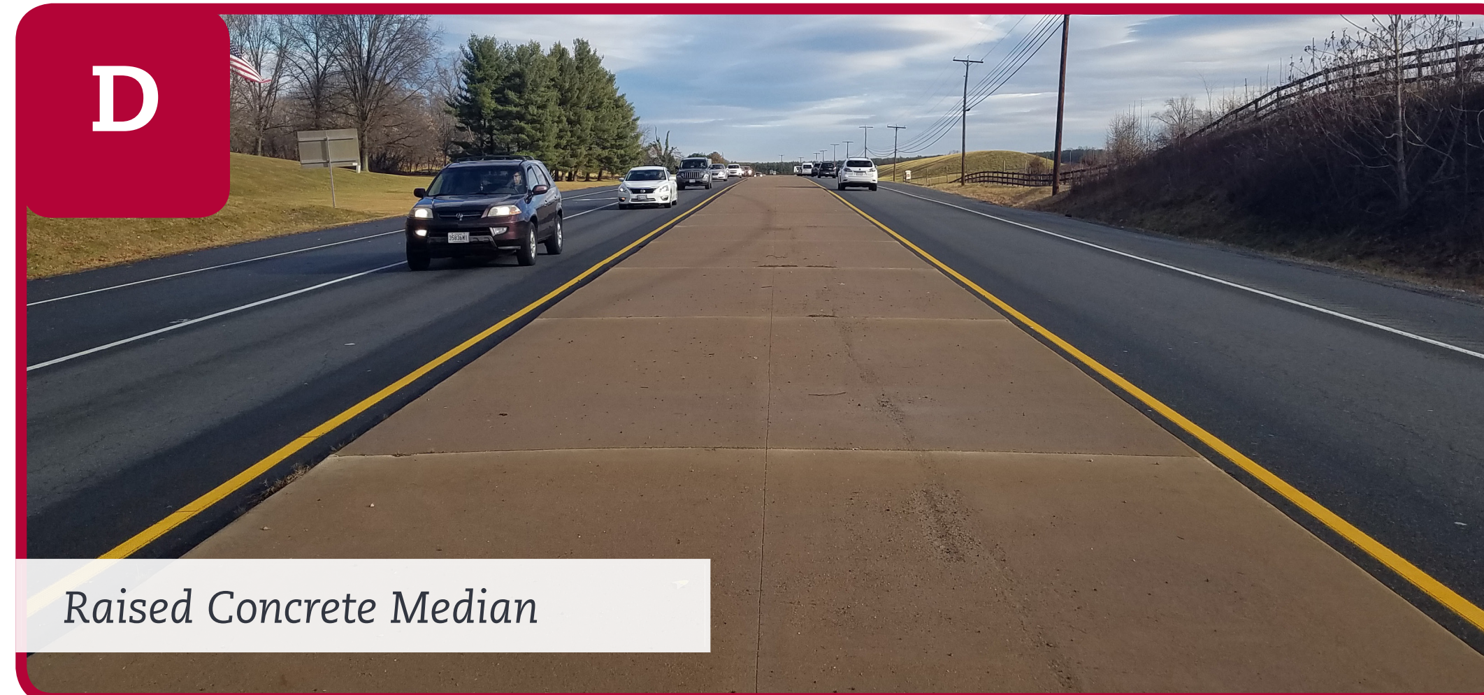
Raised Concrete Median