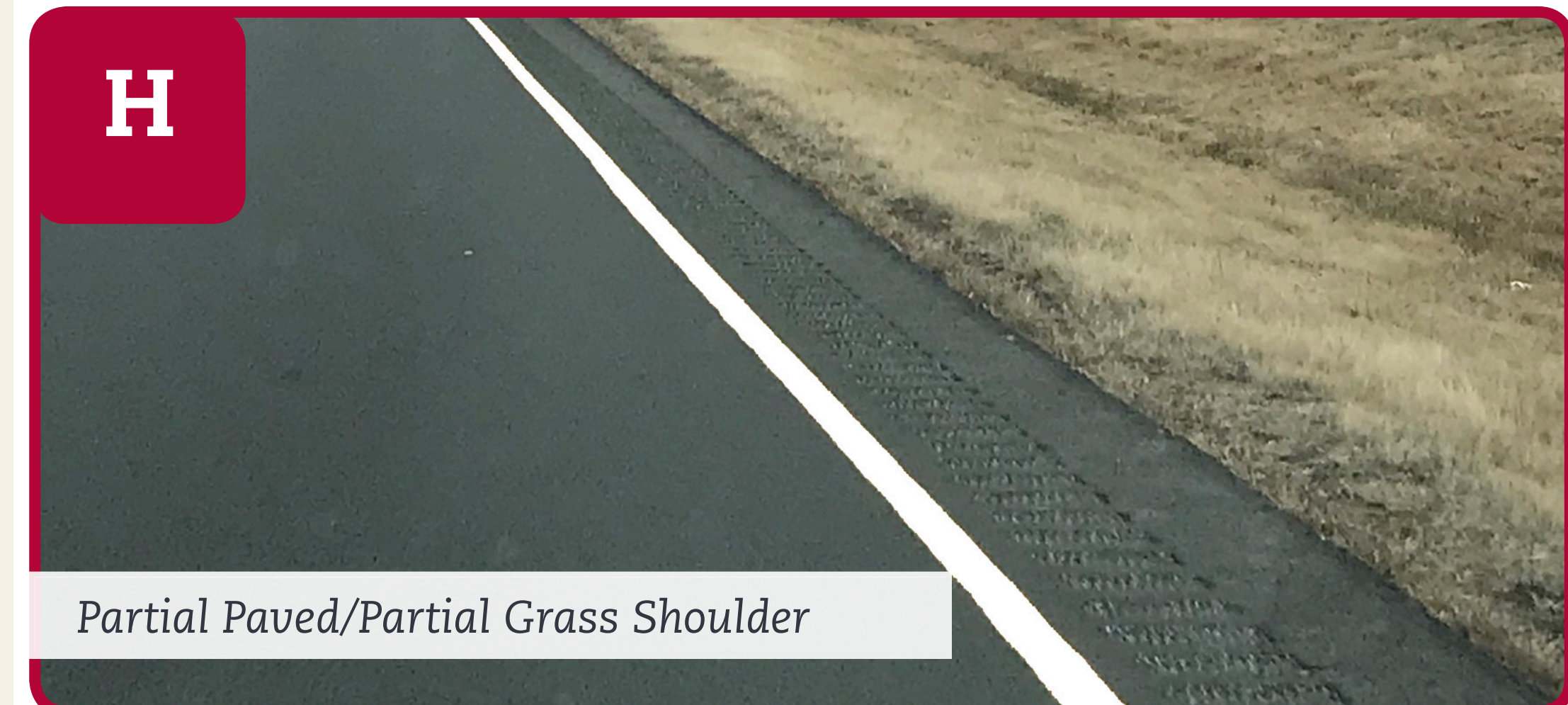
Partial Paved/Partial Grass Shoulder