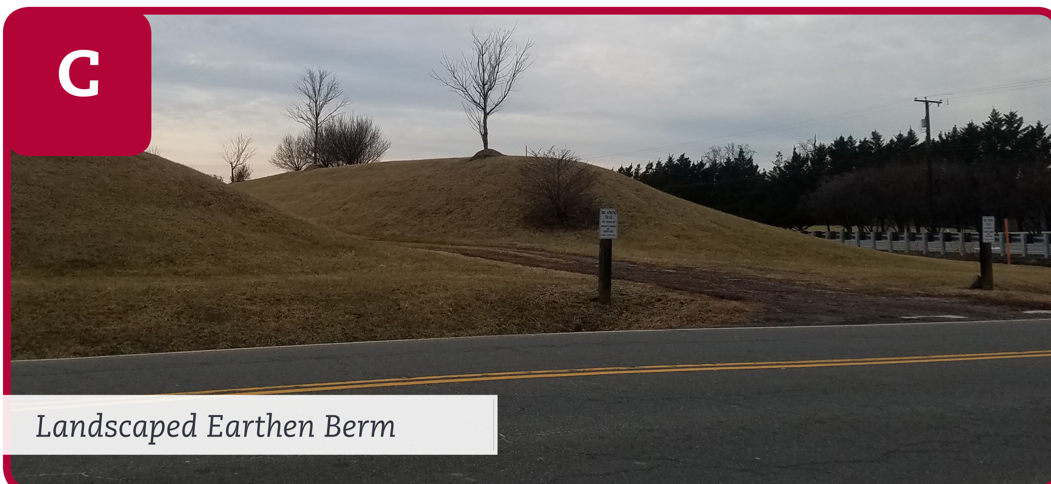
Landscaped Earthen Berm