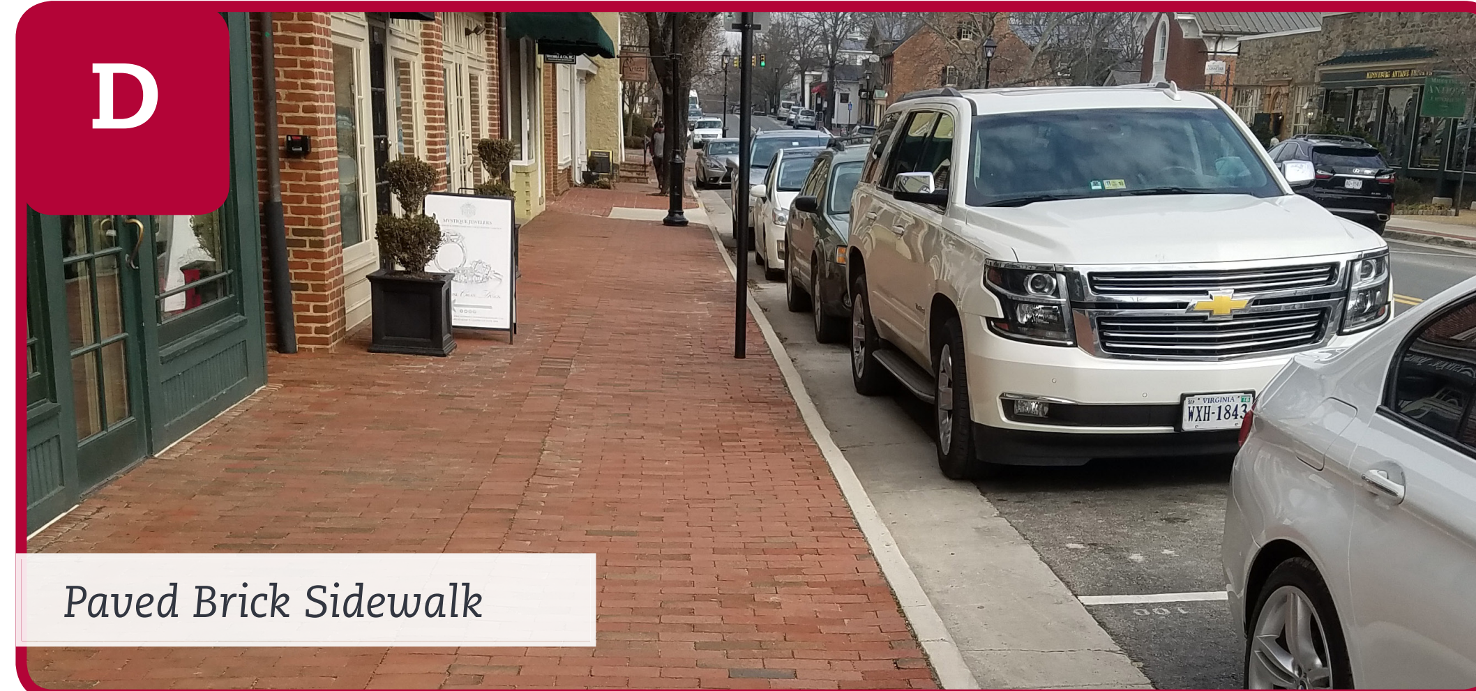
Paved Brick Sidewalk