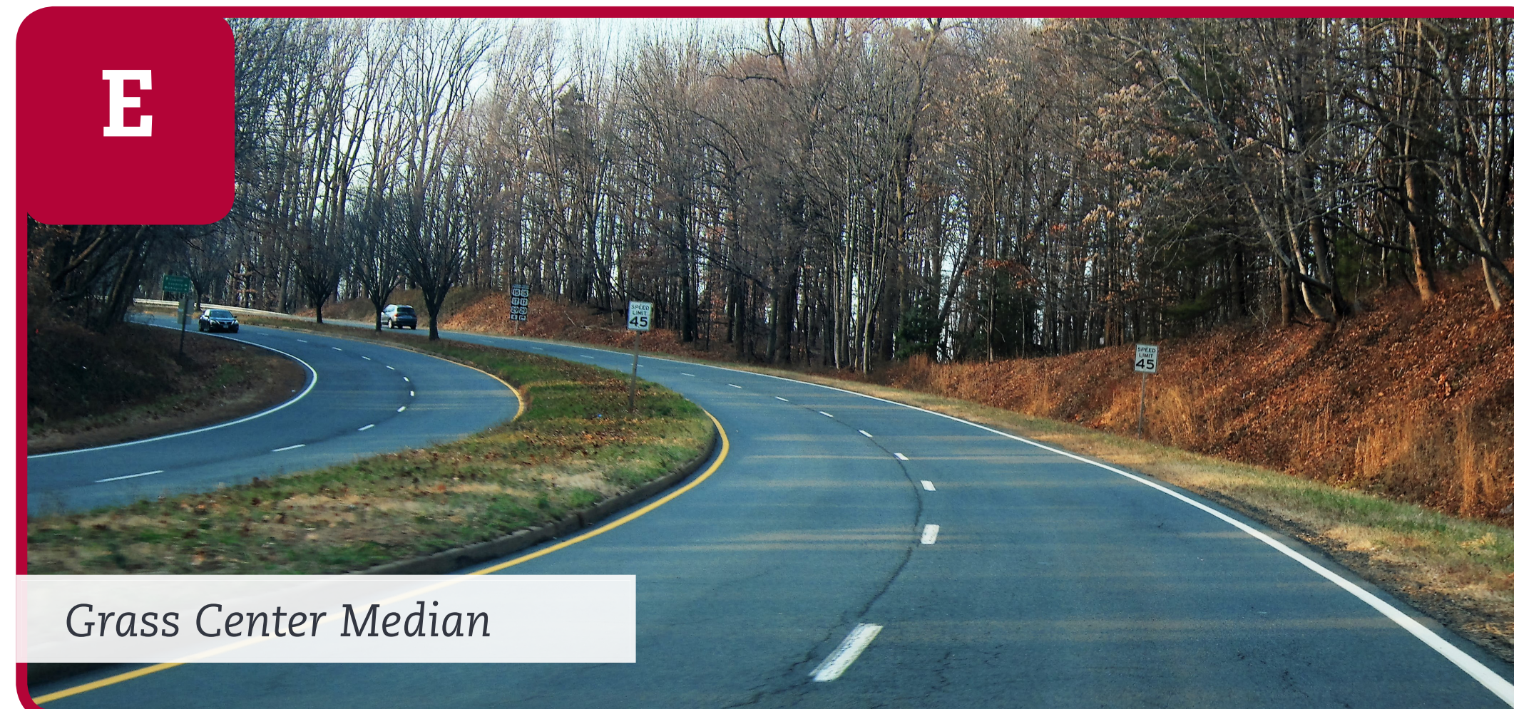
Grass Center Median