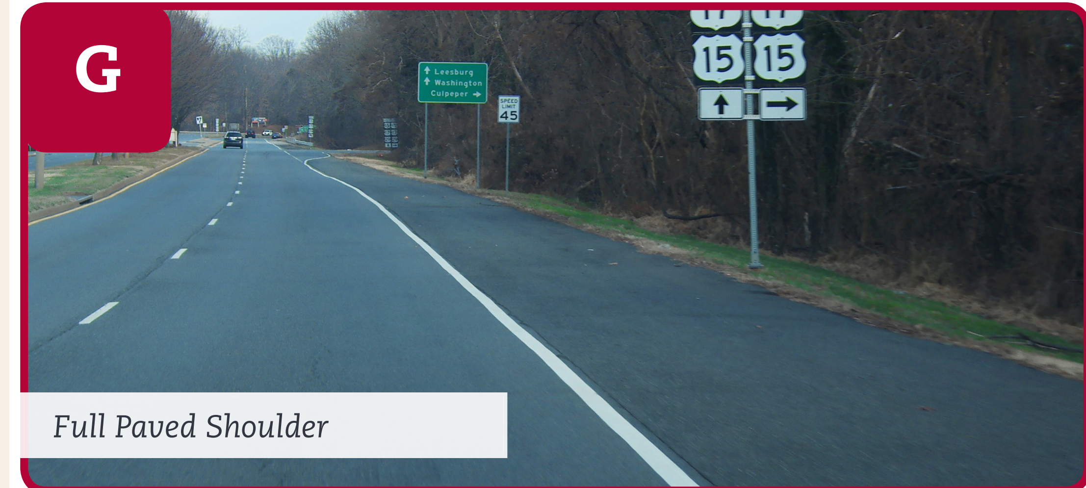
Full Paved Shoulder