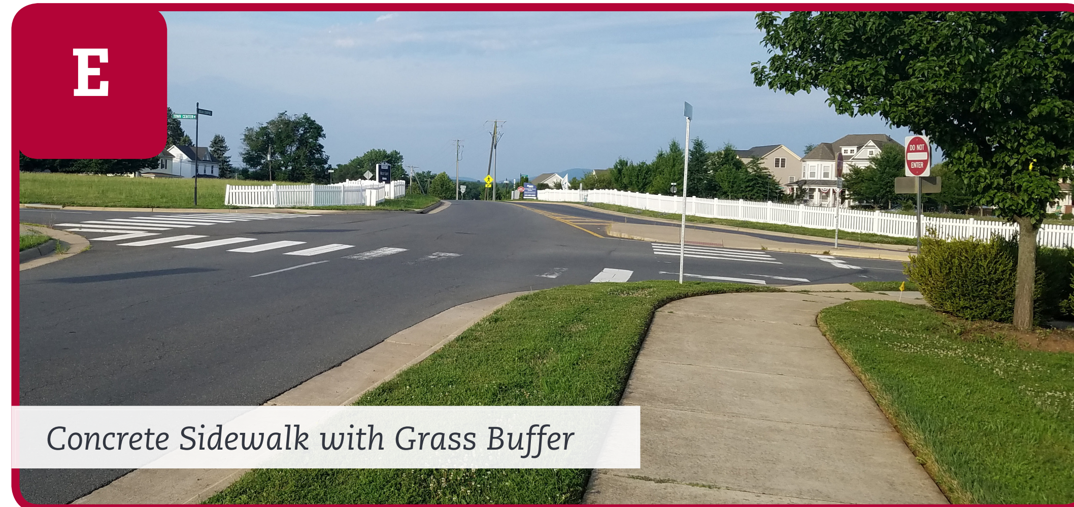
Concrete Sidewalk with Grass Buffer