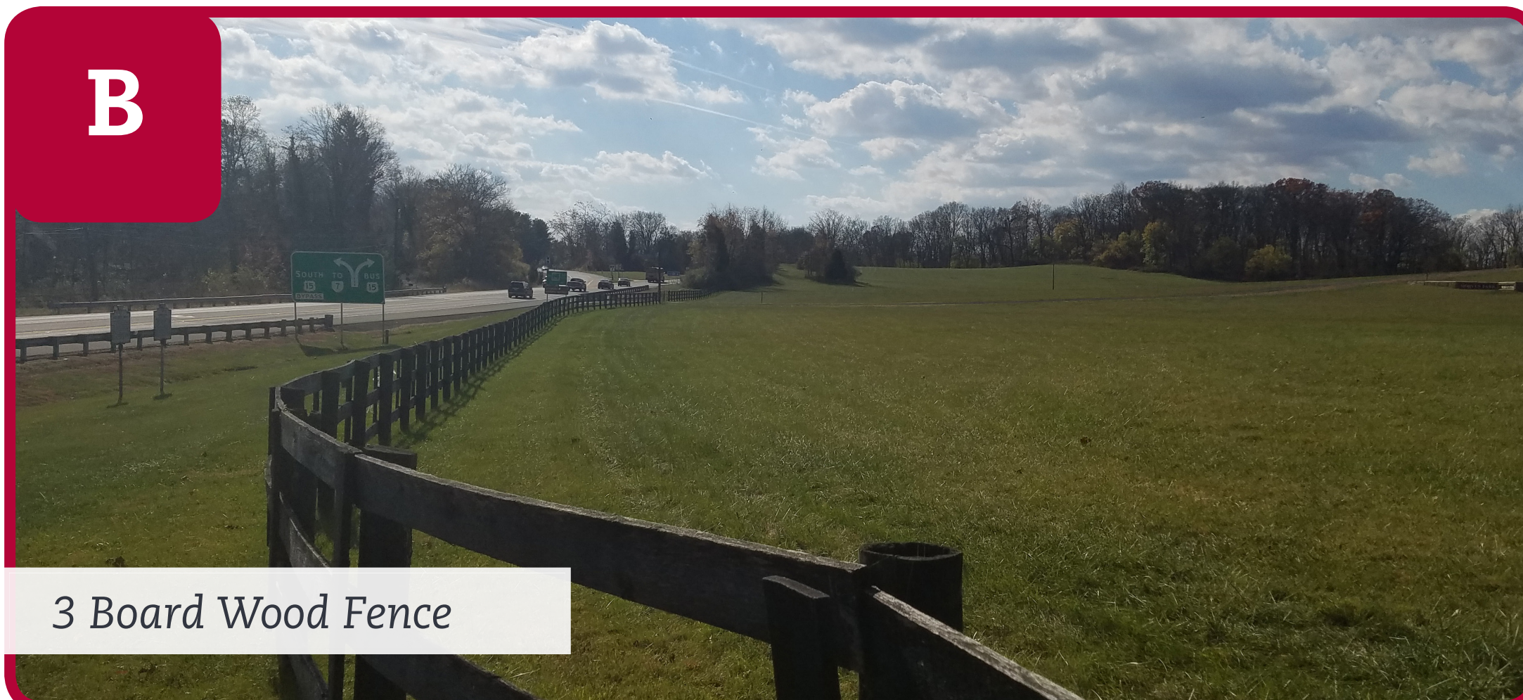
3 Board Wood Fence