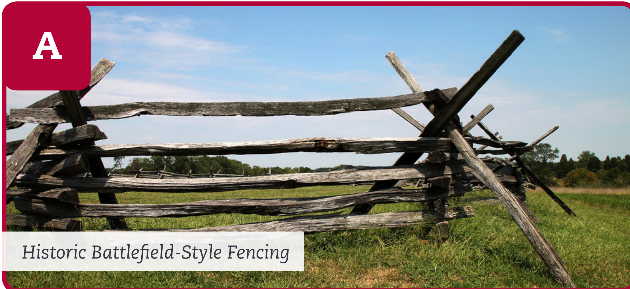
Historic Battlefield-Style Fencing