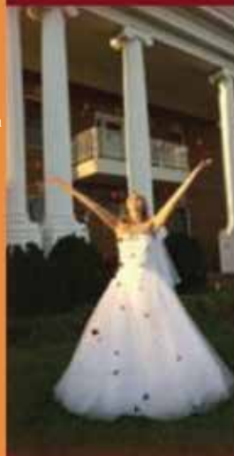
Memorable Event Sites