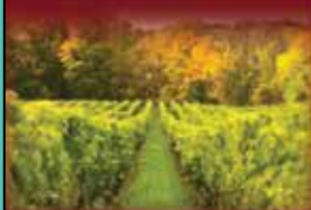
International Award- Winning Wineries