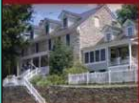
Elegant and Historic Properties