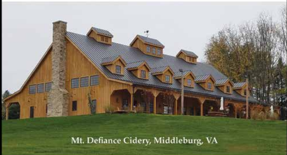
Mt. Defiance Cidery, Middleburg, VA