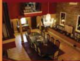
Family, Group and Corporate Engagements

Members Directory • Fun Partners • Attractions • Upcoming Events