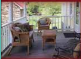
Peaceful, Relaxing Surroundings