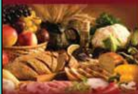
Destination Restaurants and Farm to Table Menus