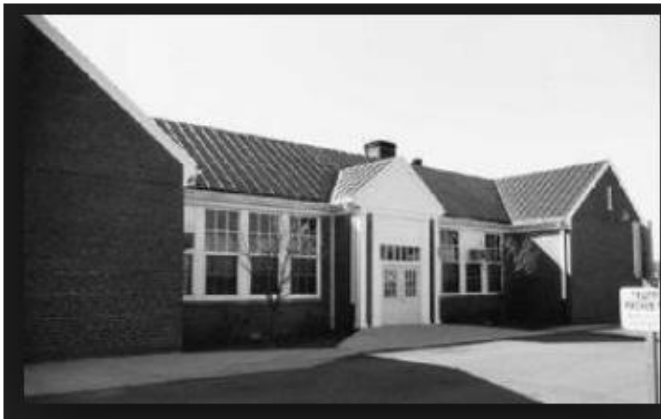
Frederick Douglass High School, opened in 1941

In 1935 the various Loudoun County African American PTAs merged into the County Wide League to fight for equal education for Loudoun’s black residents. And, in 1940 a local chapter of the NAACP organized in Loudoun to add to the effort for better quality education for African Americans in Loudoun. Their initial goal was an accredited high school for Loudoun’s African American students.