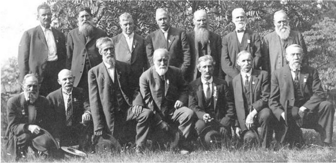
Loudoun Rangers Reunion, Waterford, 17 Sept 1910

Like the neighboring northern counties of Virginia that would soon break away to form West Virginia, Loudoun was bitterly split over secession. In some northern and western areas (Waterford, Lovettsville, Hamilton), support for the Union remained strong, but after Fort Sumter, over two-thirds of the County voted to ratify secession in May 1861 (1,626-726). The scene was set for internecine warfare as communities and families fractured over competing loyalties to North and South.