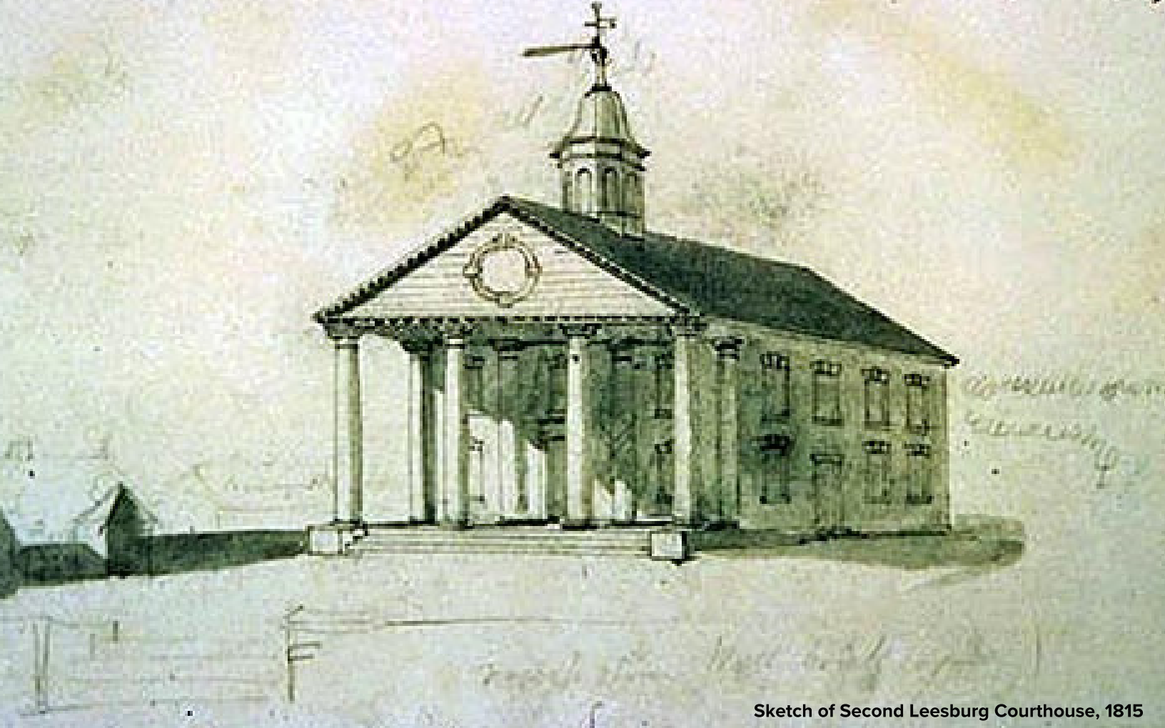
Sketch of Second Leesburg Courthouse, 1815