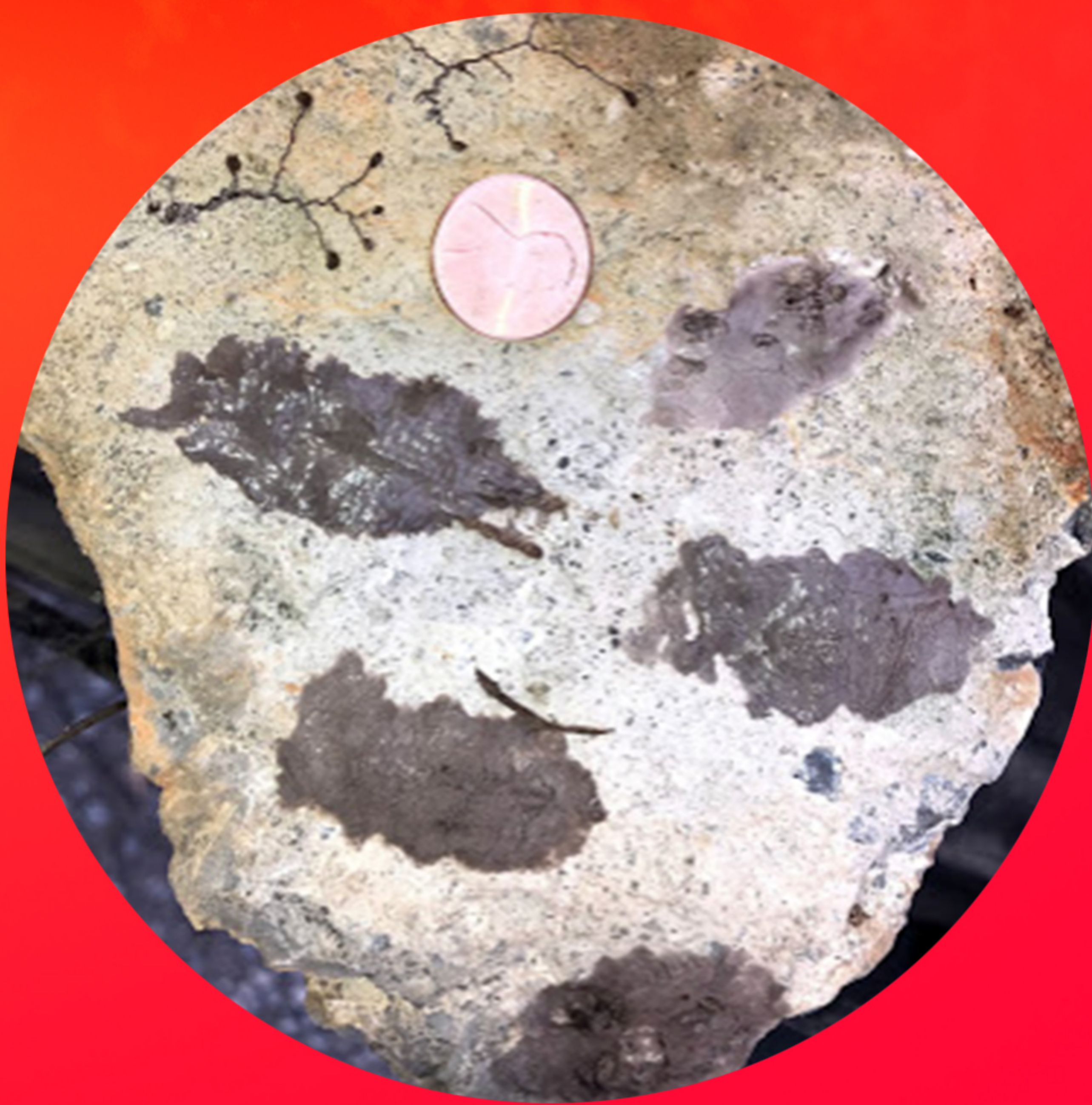
EGGS (December-May) Size: About 1.5" long