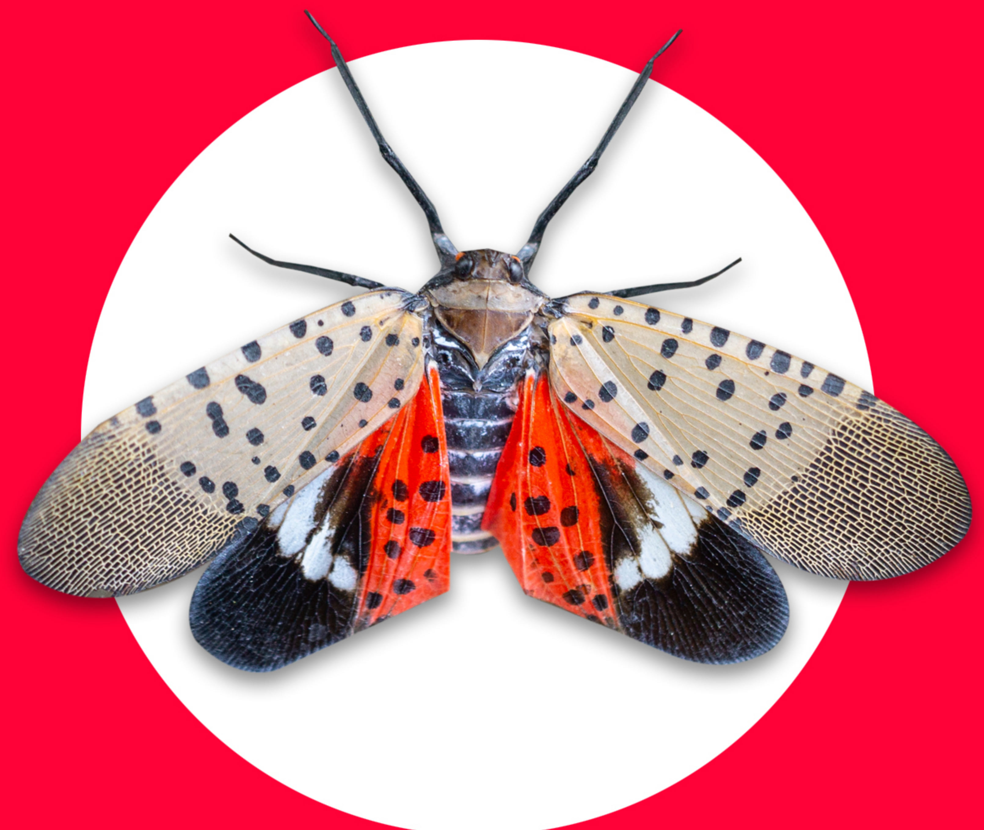
ADULT (July-December) Size: About 1" long