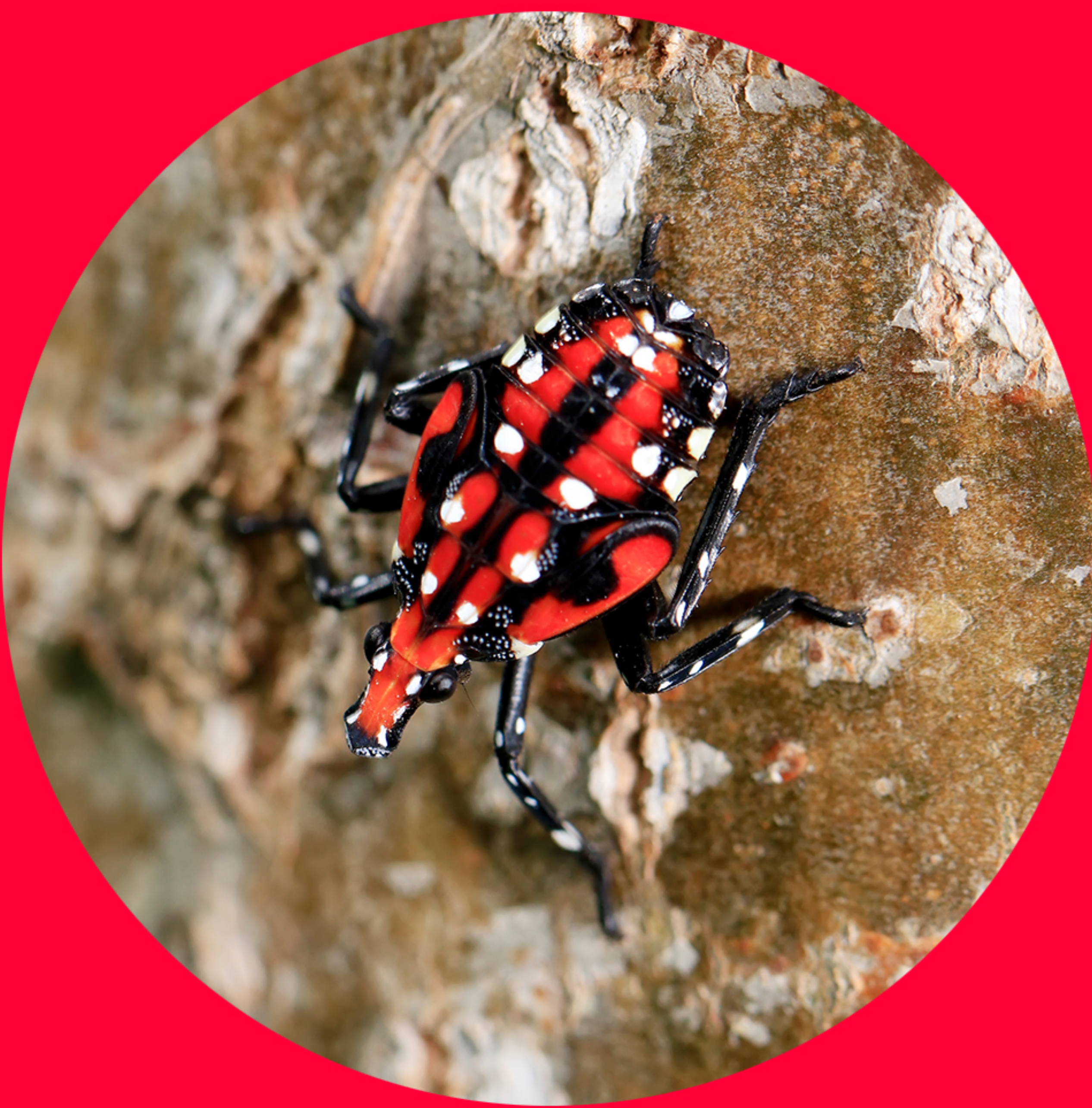
RED, BLACK AND WHITE NYMPH (July-August) Size: 7/8" long or 12mm