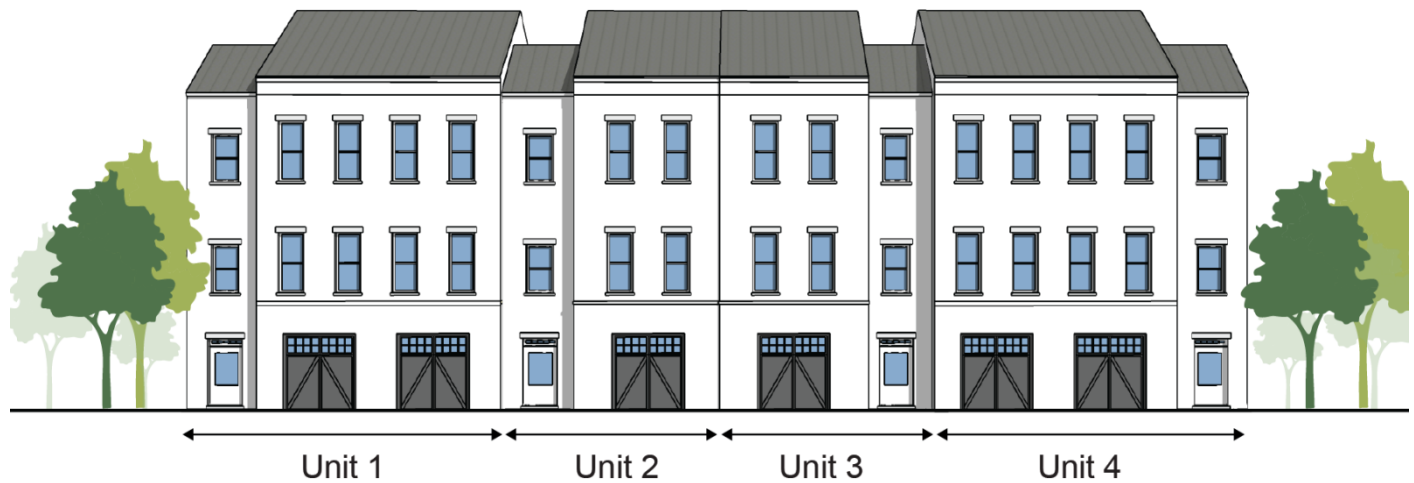
Figure 9.01-5. Example of Alternative ADU Design Option Showing 2 Single-Family Attached Townhouse ADUs that Appear as 1 Wider Single-Family Attached Townhouse 1

1 Only allowed in Zoning Districts that permit single-family attached dwelling units.