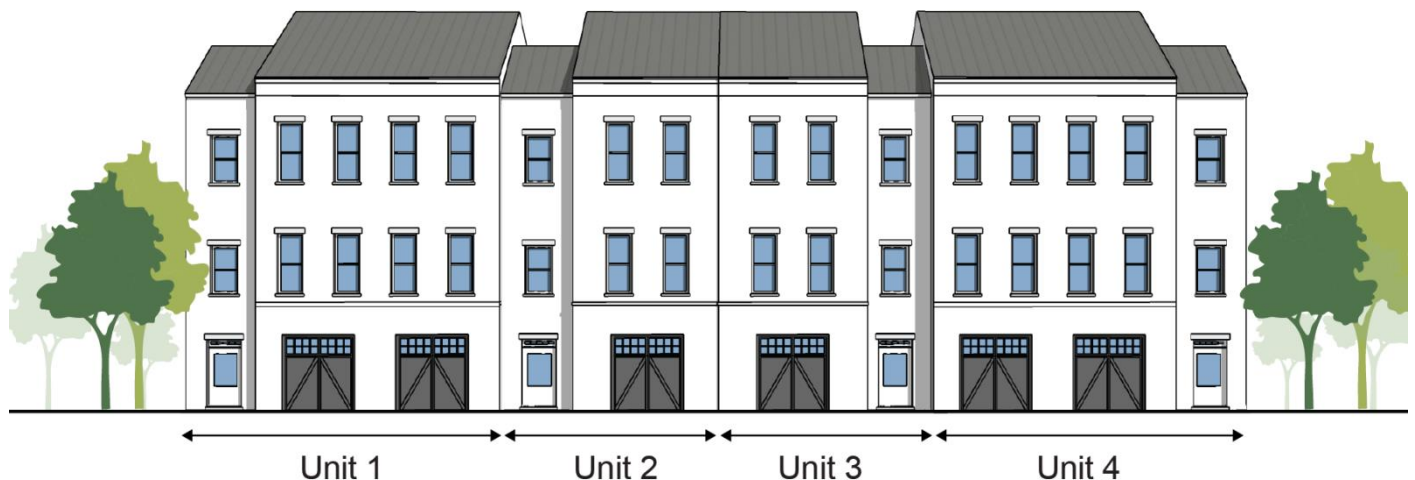
Figure 9.01-5. Example of Alternative ADU Design Option Showing 2 Single-Family Attached Townhouse ADUs that Appear as 1 Wider Single-Family Attached Townhouse 1

Condominiums provided in a building designed to appear as one SFD dwelling unit. This would only be permitted where both an SFD and some sort of MF or SFA unit type is allowed in the district.